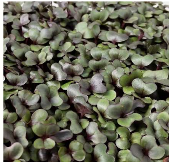
Red Vein Sorrel